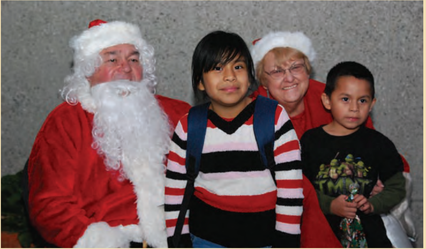
Christmas KidPak Party!

A STRATEGY FOR SECURING THE FUTURE FOR CHILDREN